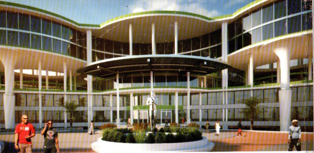
The artistic impression of the proposed modern library