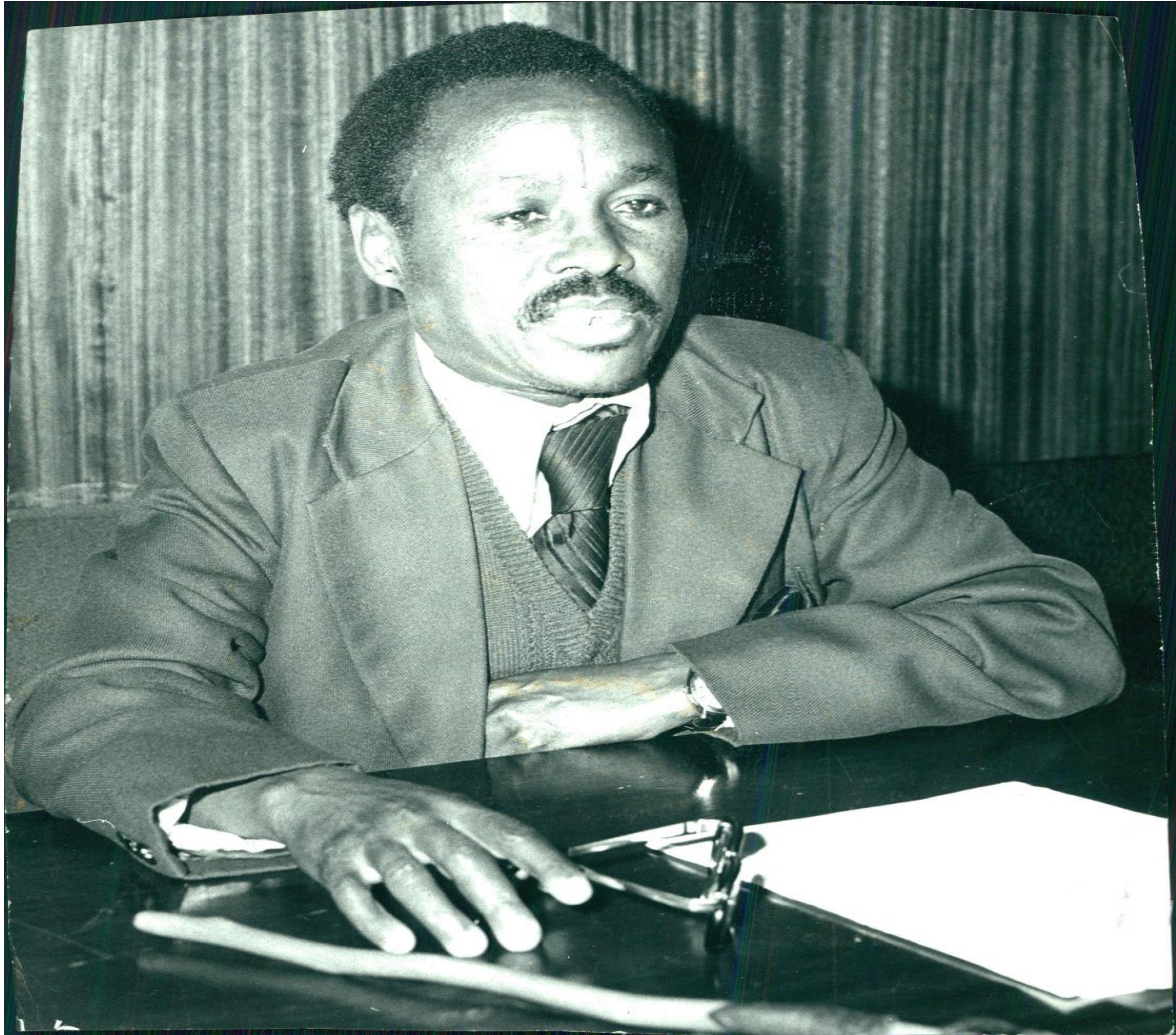
Figure 4: Toweett in his office as the assistant minister for Agriculture in the 1959