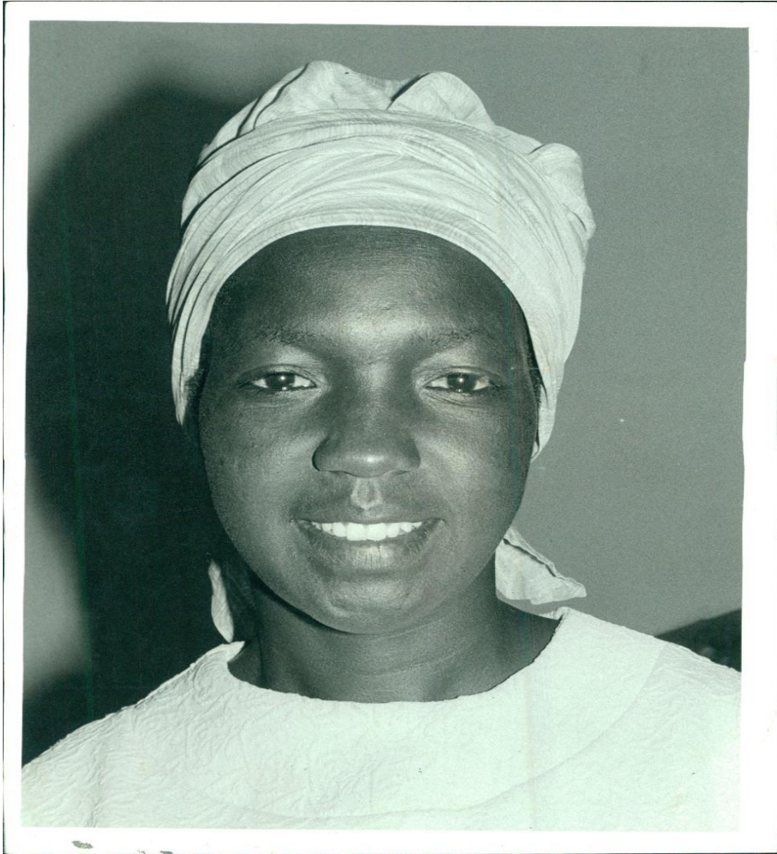
Figure 2: The picture of first wife of Taaita Arap Toweett taken in 1972 at Molo Highlands Hotel.