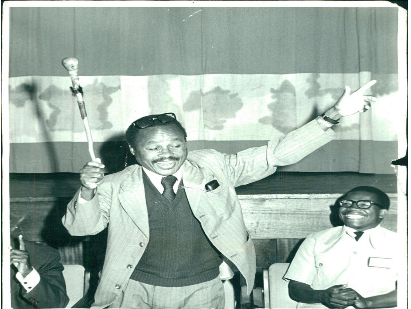
Figure 5: Toweett as a minister for education during the opening of Languages Association Conference in Nairobi, 1973.