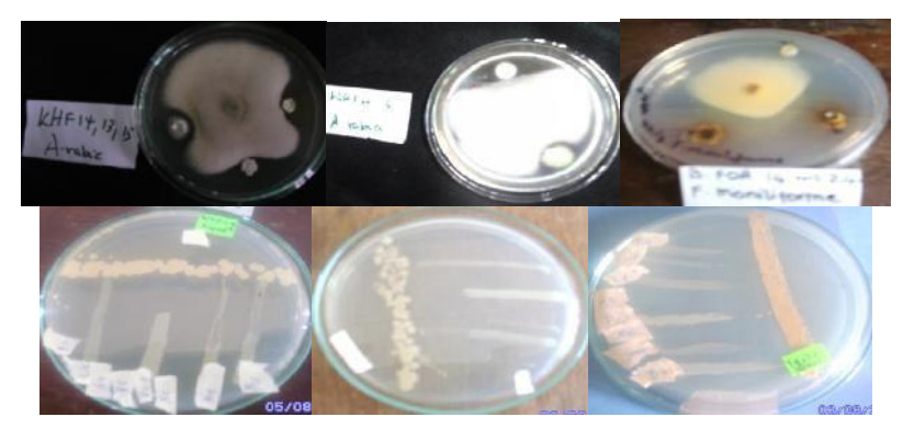
Figure 1: Antimicrobial activity of the culture filtrate. The first three plates are inhibitory tests with fungi and last three tests demonstrate inhibitory effects on tester bacteria in the primary streak method. Note areas of growth inhibition on tester microorganisms

Antifungal and antibacterial activity of some of the isolates is shown in Figure 1.