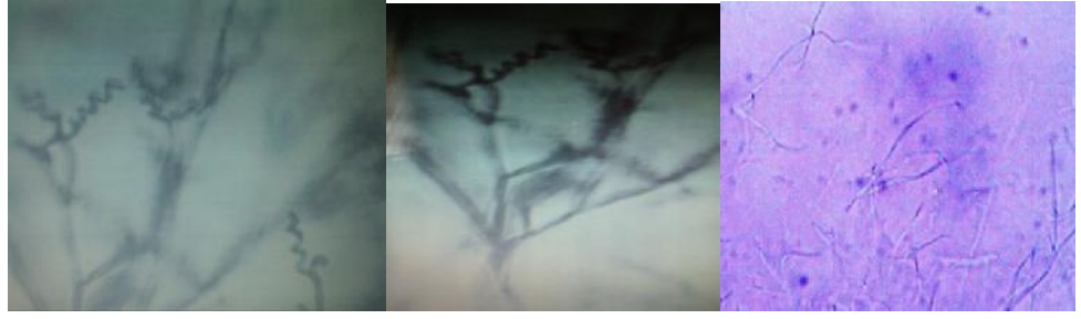
BFOR3B14BFOR3B14WHF3A15Figure 3: Examples of spores formed by the isolates with antimicrobial activity

Gram test showed all isolates were Gram positive and grew well in differential agar media. Growth on the media was abundant with all the isolates showing sporulation. Their colonies were discrete, butyrous, hard to pick and powdery surface. Microscopy was done for the aerial mycelium. The spores ranged from straight, rectus, flexous and verticilli. In some isolates it was possible to see typical Streptomyces spores in microscopic preparations (Figure 3).