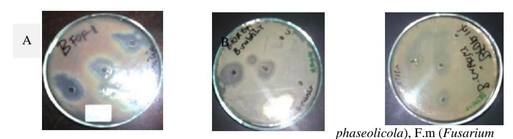
moniliforme), A.r (Ascochyta rabie), N/A means no activity.