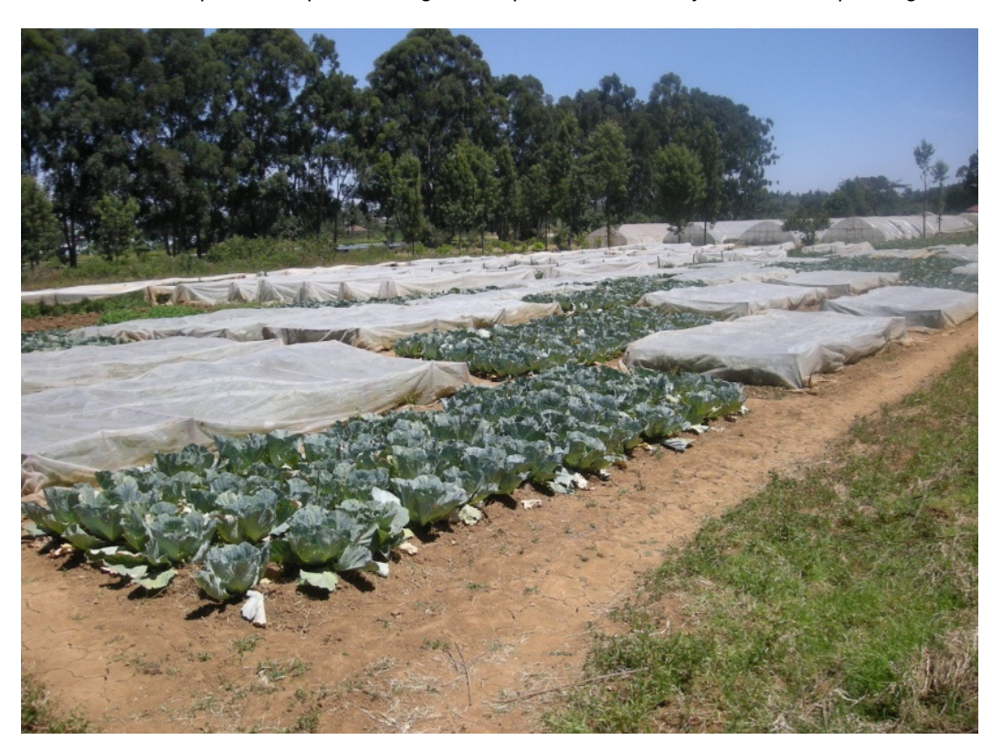
Fig. 1. Layout of the experiment showing agronet covers on the cabbage crop

The field was manually tilled using hand hoes to approximately 20 cm depth and prepared to a fine tilth using rakes. Healthy Gloria F1 hybrid cabbage seedlings produced under agronets were then transplanted at a spacing of 40 cm by 40 cm giving a total of 75 plants per plot. Triple superphosphate (45% P_20_5 ) fertilizer was used at planting at the rate of 225kg/ha [16]. Agronets were then mounted on each of the net protected plots immediately after transplanting. A two