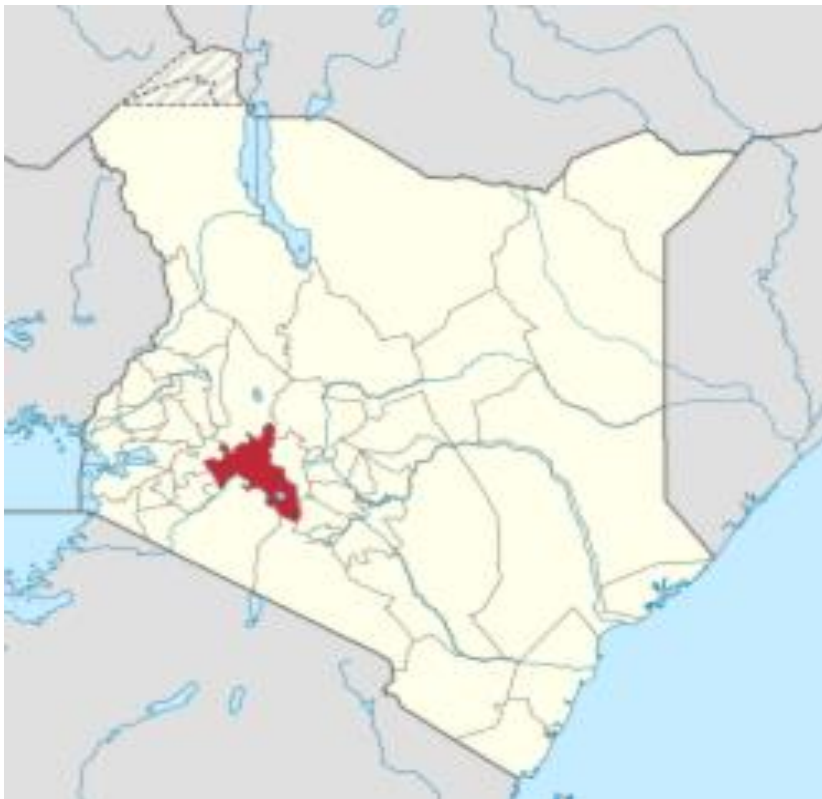
Figure 3: Map of Kenya showing Nakuru County

The study was conducted at the Poultry Research Unit, Tatton Agriculture Park (TAP) at Egerton University. The university is in Nakuru County, Njoro Sub-County (S 0°22'11.0", E 35°55'58.0), Kenya. It is 1,800 m above sea level with average temperatures between 17 - 22 °C but can drop to 11 °C during cold season. Average annual rainfall in the area is 1,200±100 mm (Egerton University Weather Station, 2018) in two seasons, short and long rains. The long rains start in March and end in May while the short rains start in October and end in December.