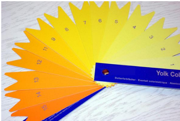
Figure 6: Roche yolk colour fan

Yolk colour was determined using Roche scale