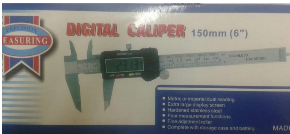
Figure 5. Digital vernier caliper