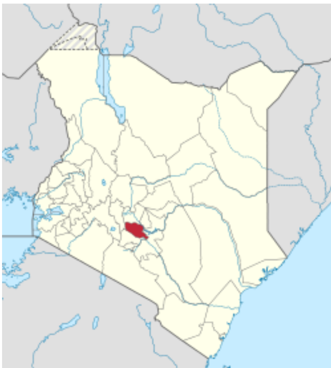
Figure 4. Map of Kenya showing Murang'a County

Mulberry leaves were harvested by plucking whole branches from National Sericulture Research Centre (NSRC). The Centre is located in Gatanga Sub-County, Murang'a County, S 1°0'9.894", E 37°4'42.661". The branches were dried at room temperature in a drying chamber at constant moisture content and then the leaves were crushed to separate from the branches at NSRC and transported to Egerton University. They were ground to pass through 1mm screen. After milling, mulberry leaf meal (MLM) was stored in bags. Proximate analysis was conducted at Animal Science Nutrition laboratory following the procedures of AOAC (AOAC, 2006 Version 3).