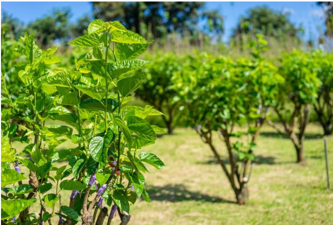
Figure 1: Mulberry plant